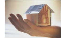
Housing Services designed to meet Housing Needs

The Shelter Plus Care Program is funded through a grant from the U.S. Department of Housing and Urban Development, to provide homeless persons with mental illness with permanent, safe, secure and decent housing, in conjunction with mental health support services. The applicants must meet the HUD definition of homeless and be mentally disabled. They must also need and participate in some level of mental health support services. The participant enters into a standard tenant/landlord lease and the amount of rental assistance is based in the FMR and is up to 30% of income.